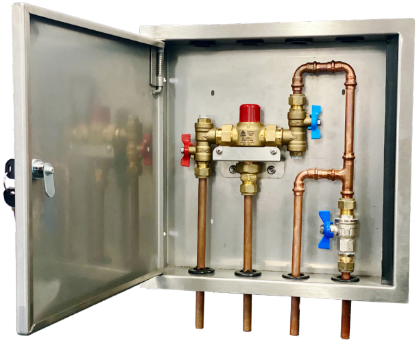
RBM T16 DN15 with cold water bypass model shown